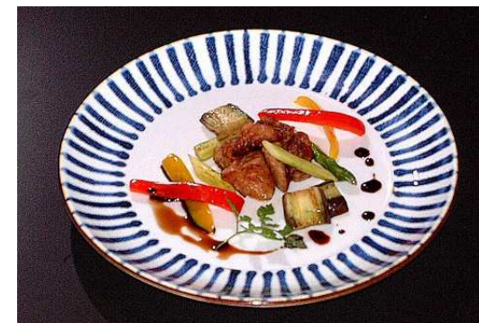
Sauteed Foie Gras and Vegetables ¥2,200