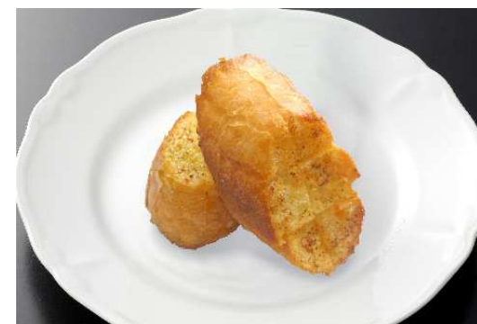
Garlic Toast ¥600