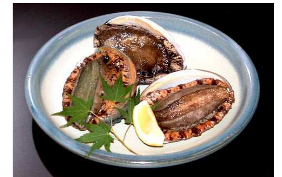
Abalone Steak (AQ)