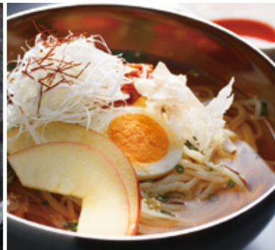
Cold Noodles ¥1,150 Set ¥1,760

If you have any food allergies, please feel free to let us know.