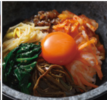
Stone-baked Bibimbap ¥1,210 Set ¥1,760