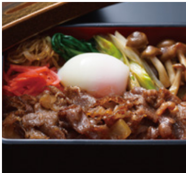
Suiyaki rice in a box ¥1,760 Set ¥2,310

© Lunch set comes with salad, soup, dessert and coffee.